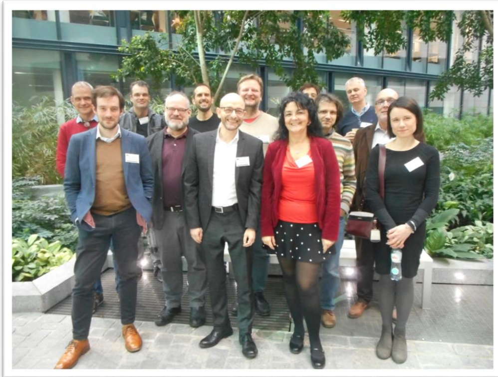
The TEQ members and the appointed reviewers at the Research Executive Agency of the European Commission for the TEQ first Review Meeting, Brussels, 26 th February 2019.